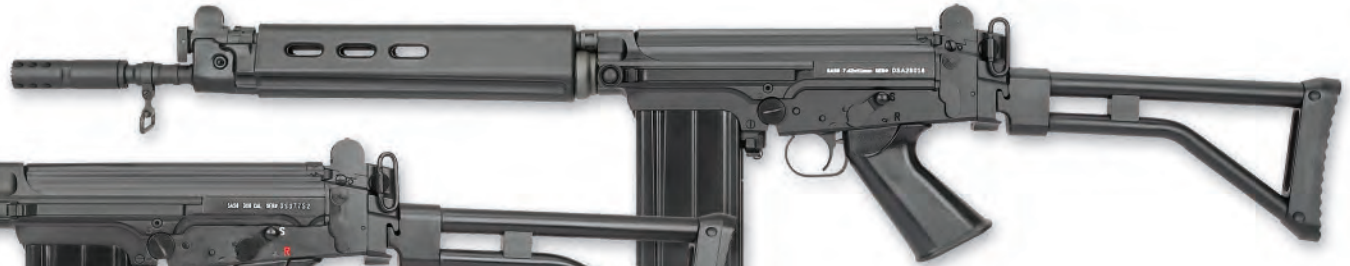
SA58™ 18 Inch Para