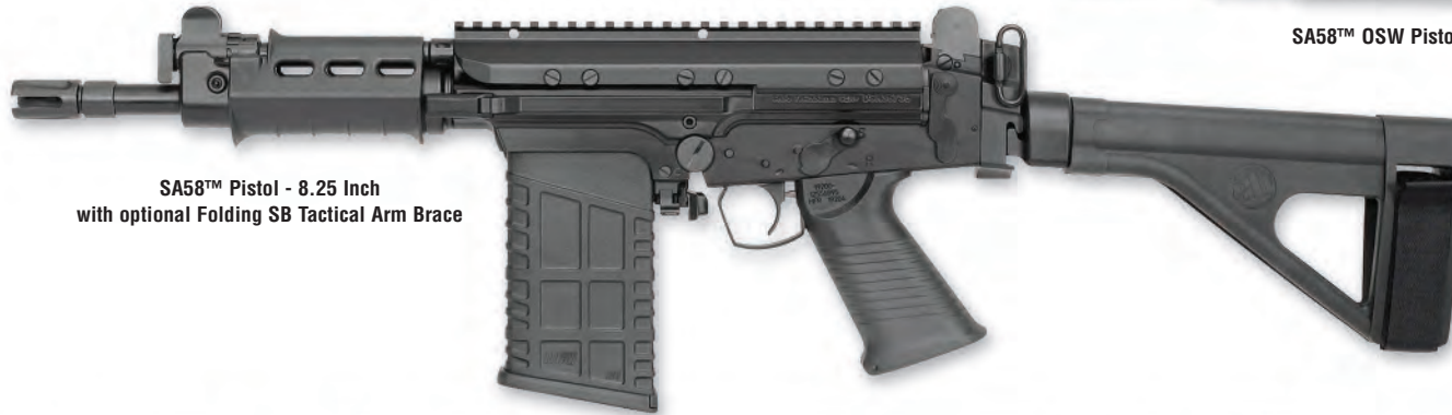
SA58™ Pistol - 8.25 Inch with optional Folding SB Tactical Arm Brace