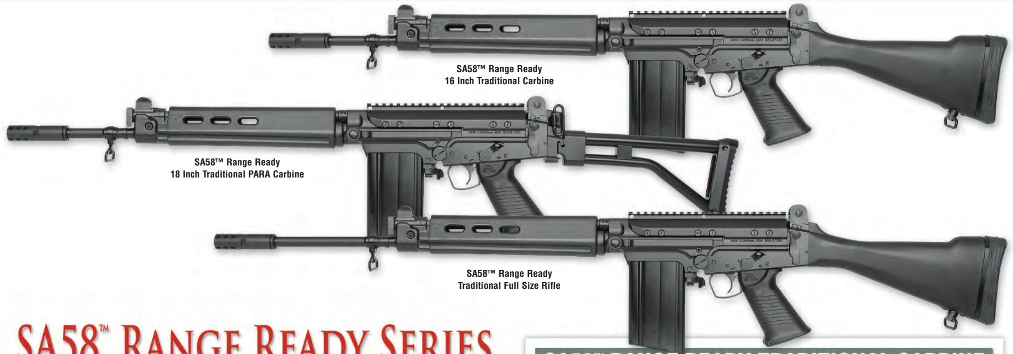
SA58™ Range Ready 16 Inch Traditional Carbine