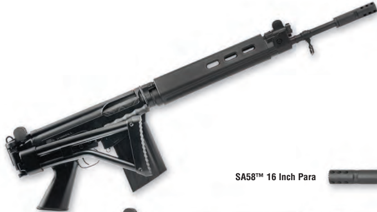
SA58™ 16 Inch Para

Today, few things can be described as “better than the original”. After many years of development and production we are confident that our SA58™ rifles exceed the quality of any FAL type rifle ever produced. We specialize in manufacturing and modernization of Proven Legacy systems like the venerable FAL rifle. Classics still have their place, so with this in mind DSA created a line of SA58™ rifles that mirror the configurations of the rifles imported into the USA during the 60’s, 70’s and 80’s which provide the look and feel of an original FAL rifle. Now it’s possible to own a reasonably priced rifle that will look and feel like a classic, and perform better than an original.