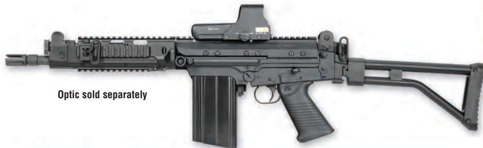
Optic sold separately

The DS Arms Operational Specialist Weapon (OSW) has become the world standard for .30 caliber performance in a small package. In service with military and law enforcement units around the globe, the OSW provides battle proven performance on a modular platform that can be configured to meet any mission requirement. The OSW's compact size makes it the perfect choice for tactical units, urban operations, executive or convoy protection work. The SA58™ OSW provides a decisive edge when deploying from vehicles with the added benefit of .30 caliber superiority over 9mm SMG's and 5.56mm carbines. Operate with confidence; you will not be under equipped.