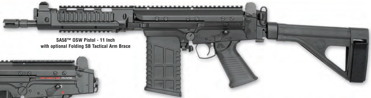
SA58™ OSW Pistol - 11 Inch with optional Folding SB Tactical Arm Brace