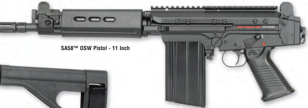
SA58™ OSW Pistol - 11 Inch