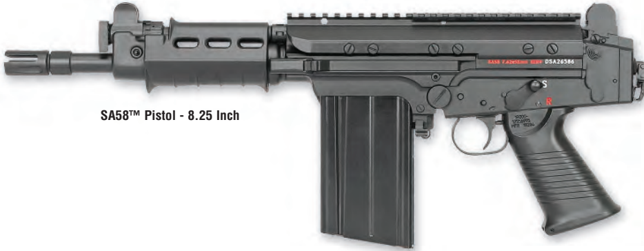
SA58™ Pistol - 8.25 Inch