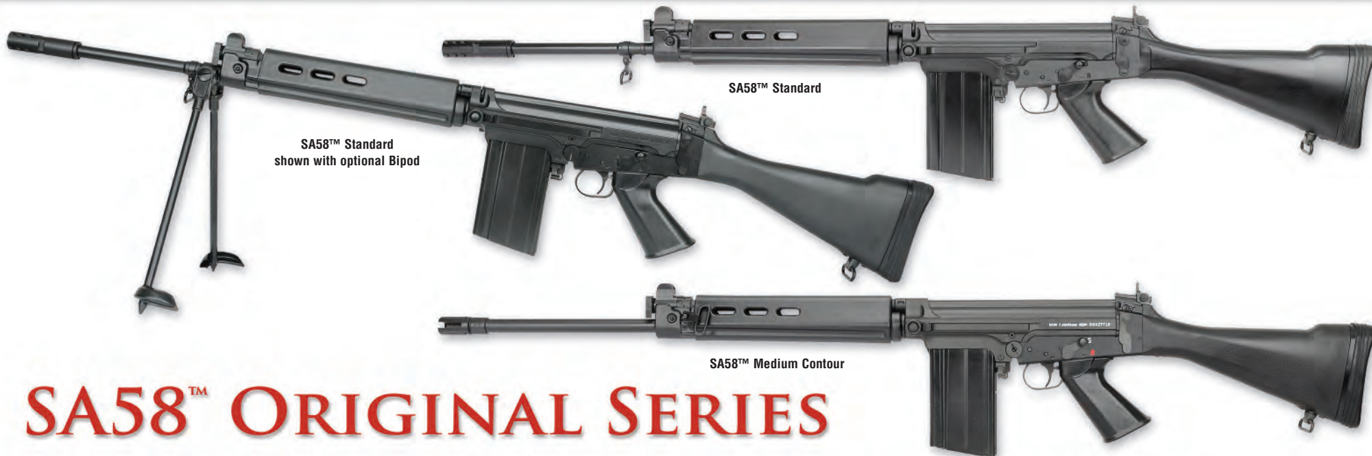
SA58™ Standard shown with optional Bipod